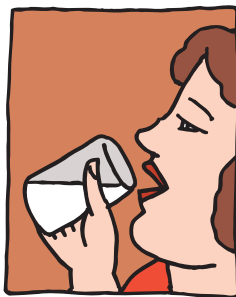
Thirsty all the time