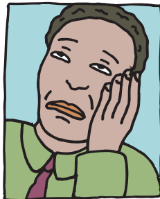
Weak or tired