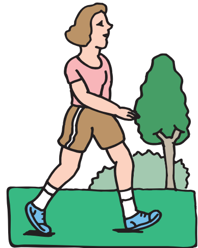
Fast walking Gardening