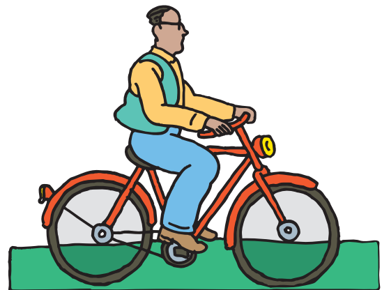
Bike riding Team sports