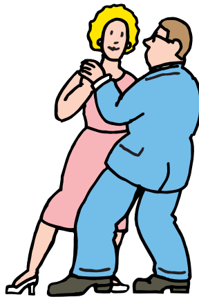
Dancing Light jogging in place